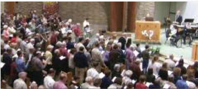
PCRT Grand Rapids, MI